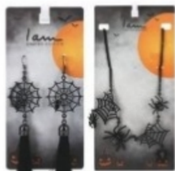
Jewelry or select fashion accessories. Available in select stores.

ExtraBucks® Rewards offer limit of 1 per household with card. (20004064360)