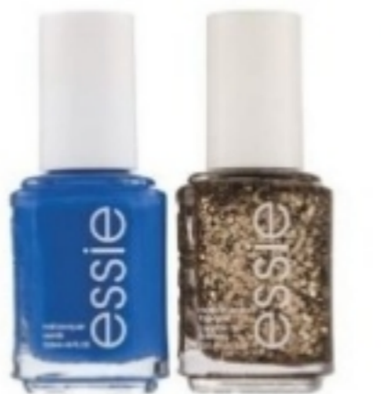
essie nail polish or care.

ExtraBucks® Rewards offer limit of 1 per household with card. (20004010410)