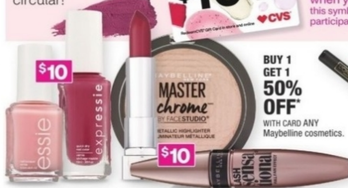
essie nail polish or care.

$10 Gift Card when you spend $25. Look for this symbol for participating items: $10