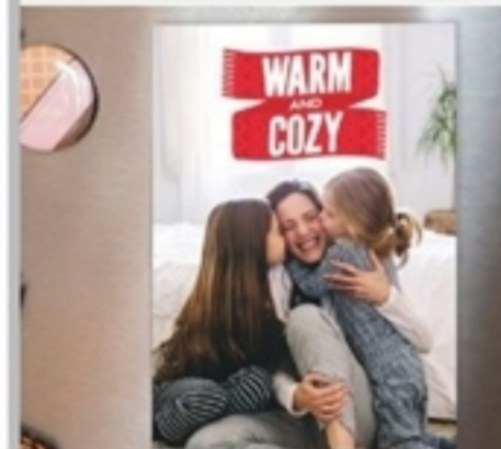
WITH CARD Photo magnets.