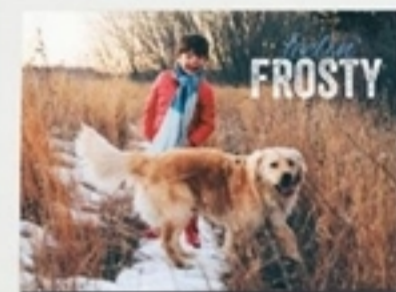
WITH CARD Photo panels.