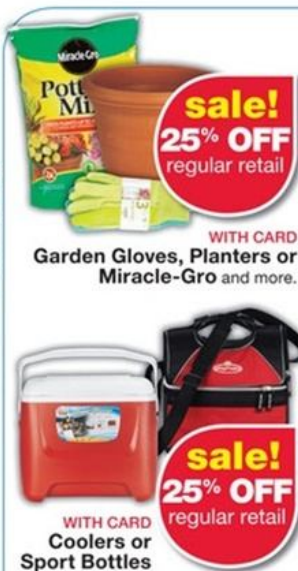
WITH CARD Garden Gloves, Planters or Miracle-Gro and more.