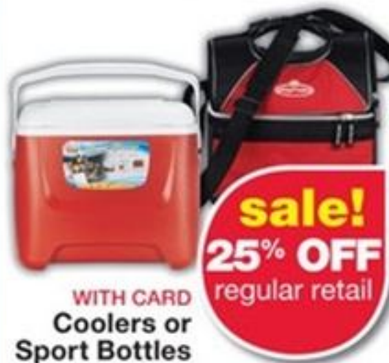
WITH CARD Coolers or Sport Bottles