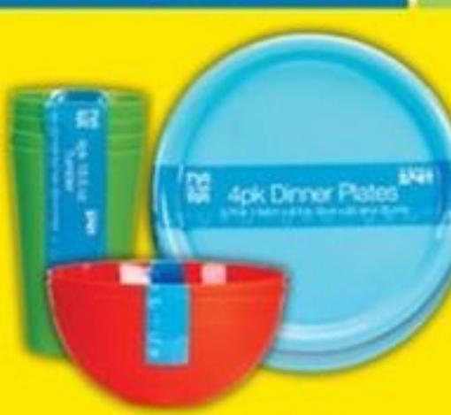
Picnic Dinnerware or Drinkware