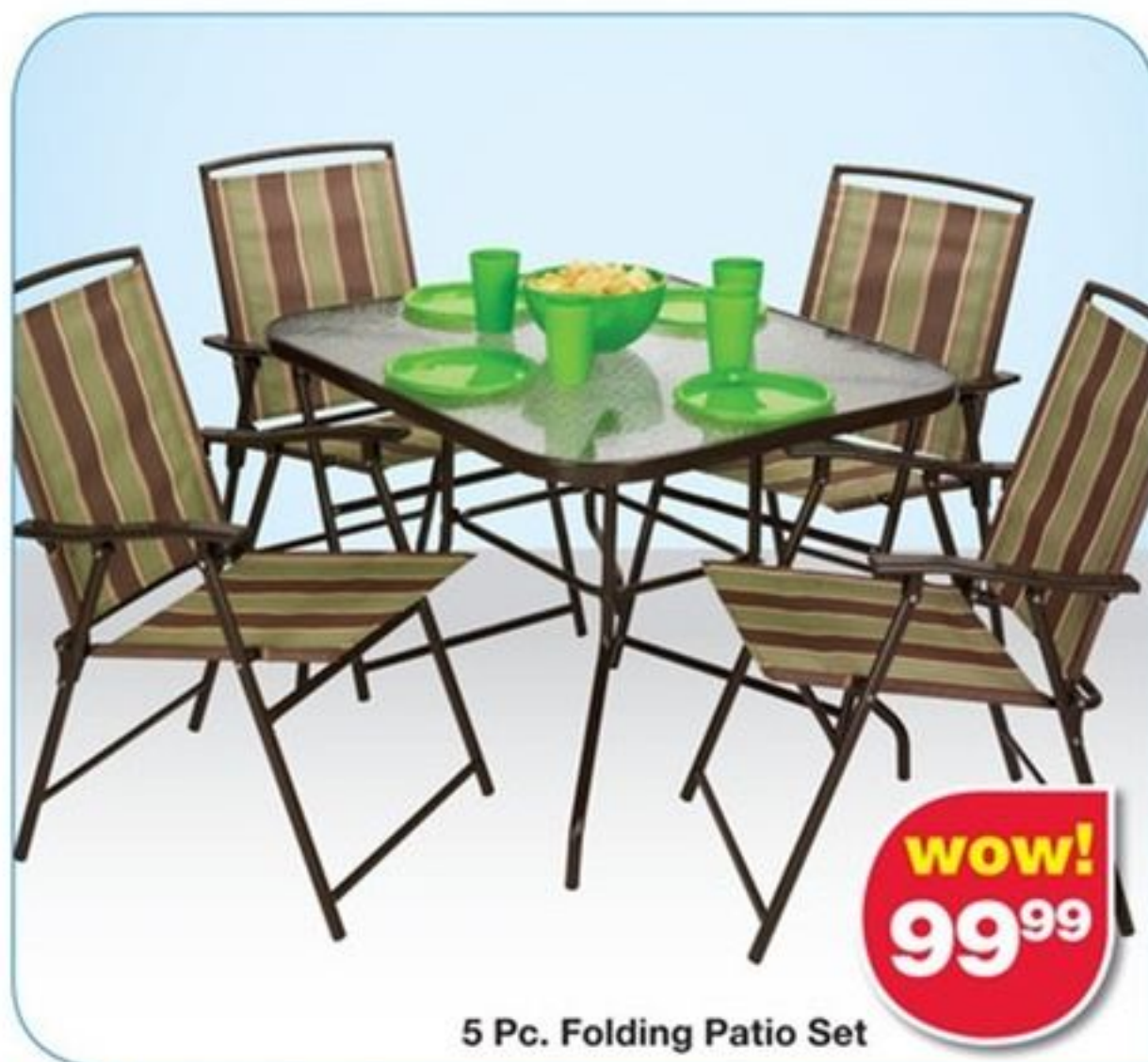
5 Pc. Folding Patio Set