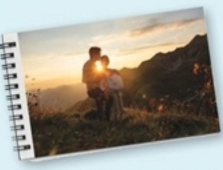
Photo book 4x6.