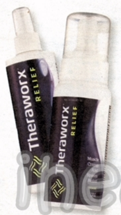
Theraworx relief spray or foam 7.1 oz.

*Limited to prescriptions filled at CVS Pharmacy®.