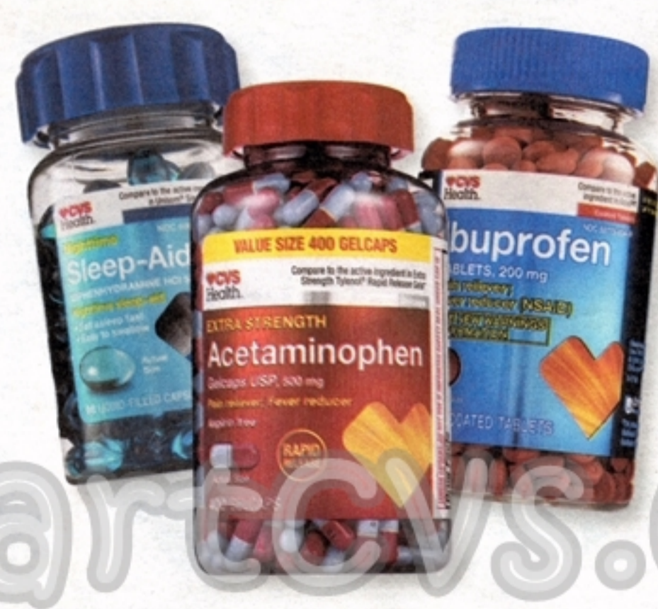
CVS Health pain relief or sleep aids (excludes children's and apothecary).