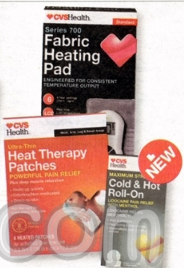
Select CVS Health external pain relief.

iheartcv.com... view advance CVS/pharmacy ads and deals!