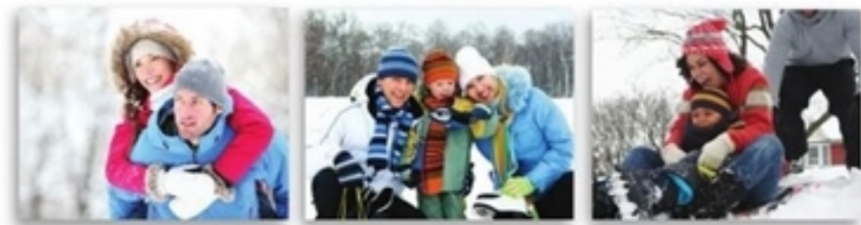
photo prints Same-day pickup available.

WITH CARD ANY Swiffer, Febreze laundry, Cascade, Air Wick, Glade, Select Febreze household or Finish.